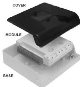
Figure 3A. Surface Mount Box:

Surface Mount Box Base is affixed to mounting surface, and then the module and cover are screwed onto the base using the two screws supplied.