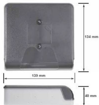
Surface Mounting Box Dimension:

Surface Mount Box Base is affixed to mounting surface, and then the module and cover are screwed onto the base using the two screws supplied.