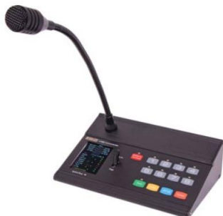
Optional Mic: (FS-4470-MIC)

Designed specifically for use with the FS-ALT-4470 audio switcher, the addition of this microphone enables local paging to any zone or combination of zones. Paging to any any zone may be inhibited by selecting the paging on/off function for individual zones on the FS-ALT-4470. The paging microphone may be located up to 300 metres from the FS-ALT-4470 and all audio and control signals are carried via an inexpensive Cat 5 or similar data cable.